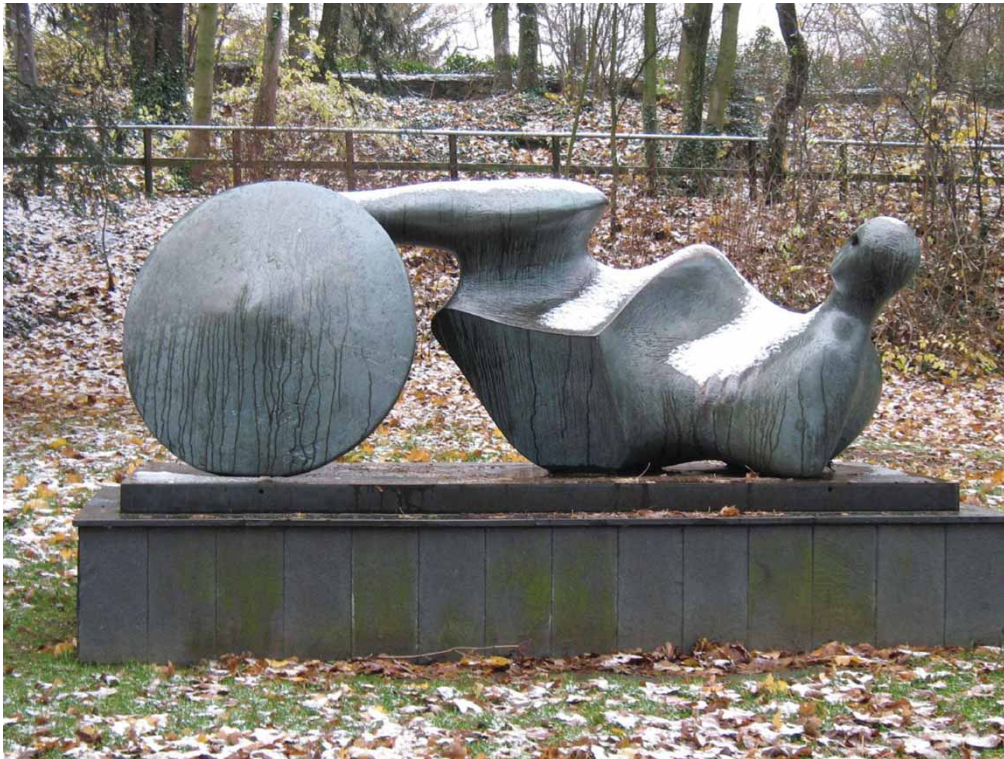
Figure 6a. Henry Moore, Goslar Warrior (1973–4), Goslar, Germany.

fallen of past wars, this monument was seen to glorify war. Instead of simply removing the monument and thereby curbing public debate, Hamburg's Senate initiated a competition in 1982 to create a new monument that would directly challenge the old one, to illuminate its questionable past purposes and to reframe its status as an historical document and witness. The neologism Gegendenkmal first appears in this competition brief. 41